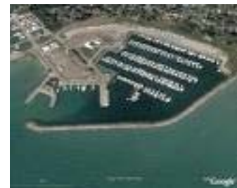
Above: the Port Dover Marina. Port Dover is no longer an important commercial harbour. Much of the work of 19 th century stonehookers remains, hidden under modern cement. Below: the Harbour Museum